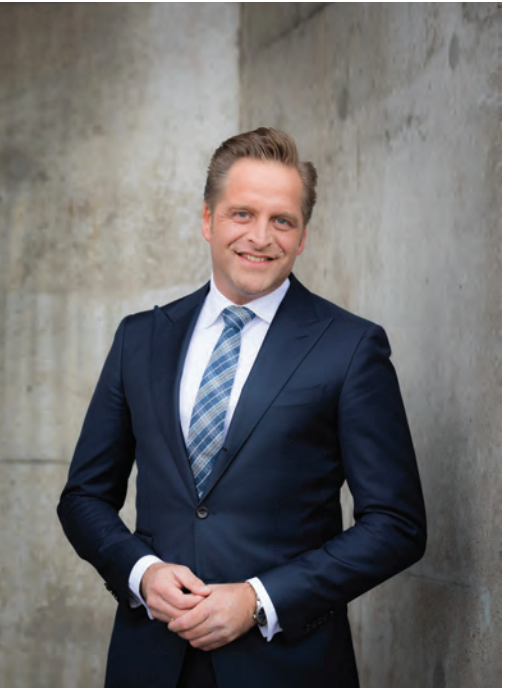
Hugo de Jonge Deputy prime Minister, Minister of Health, welfare and sport The Netherlands

Finally, in order to fully understand the vision underpinning the Netherlands' current policy on care for older adults, it is vital to consider its historical context, the principles on which it is based, and the social developments that have helped shape this policy. I am pleased that this special feature offers readers insight into the Dutch approach to care for older adults and enables them to examine aging in the Netherlands from a governmental and civil society perspective. \blacklozenge