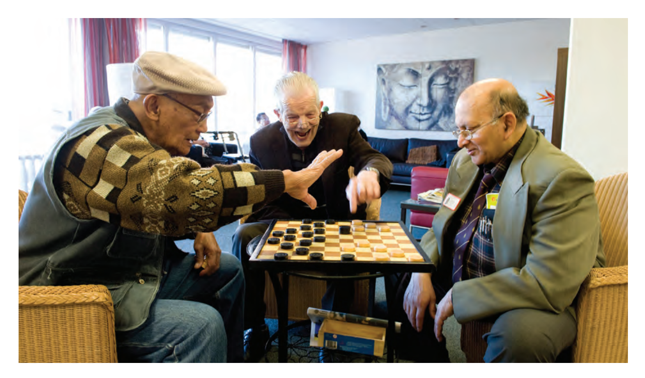
Seniors participating in activities of choice.

Cities and Communities. Together with network partners, participating cities encourage active aging in urban environments by promoting security and creating opportunities for healthy activities and social and cultural participation. I am confident that together with the existing nationwide coalition, we can combat loneliness among older people.